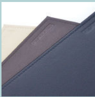
Leather table mats