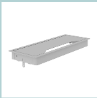
Metal grommet: 317x119 mm, H=27 mm